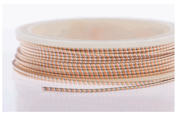
16-fold helix made of silver, nickel, copper and brass wires