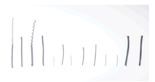
different spiral geometries/-variants

for more details, for example refer to our information sheets " ELCON ", "flat and profiled wires", "wire compositions insulated" or " ElCu ".